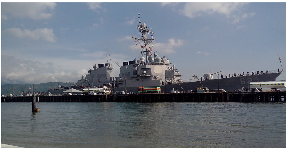
A US Navy Aegis destroyer pays a recent port call to Subic Bay in the Philippines. Since being kicked out of Subic Bay in 1992 the US is now averaging five warship visits per week as the Obama pivot requires more ports for US warships.