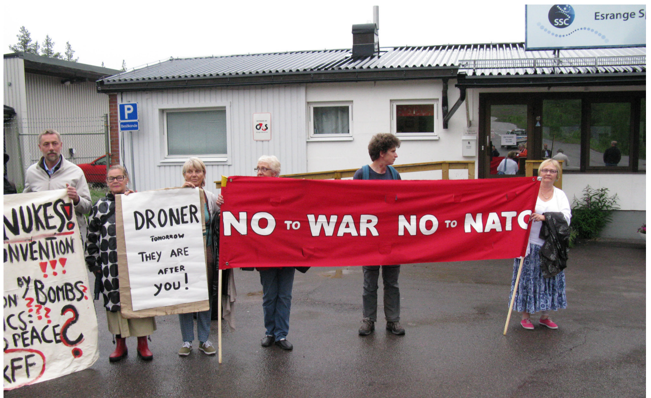
Conference delegates took a bus to the Esrangle Space Center and following a meeting with Public Relations staff held a vigil at the gate as workers left for the day.

Finnish corporate controlled media, like in Sweden