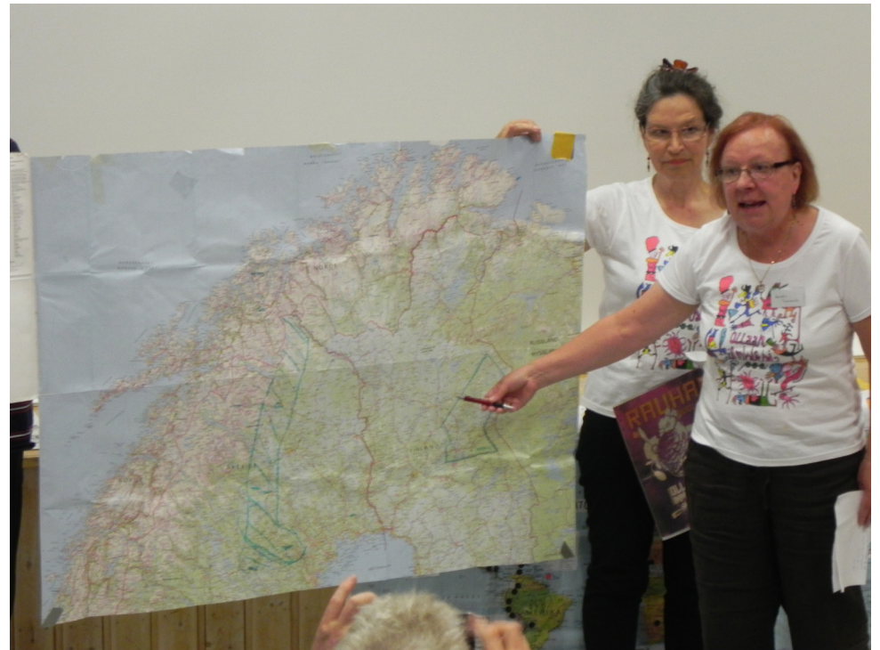
A delegation of peace activists from Finland attended the 21st annual Global Network conference in Sweden and shared a map detailing the NATO drone range that has been established along the border with Russia.

Those people who are flying as a hobby, because they like to fly ordinary sport planes, cannot use the Kemijärvi airport